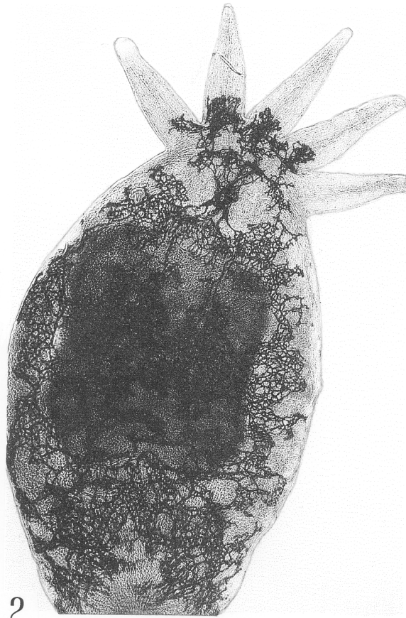
Temnosewellia minor (Haswell, 1887)